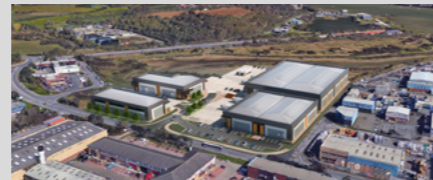
MEDWAY CITY ESTATE Rochester