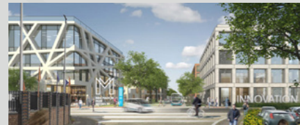
INNOVATION PARK MEDWAY Medway www.northkententerprisezone.co.uk