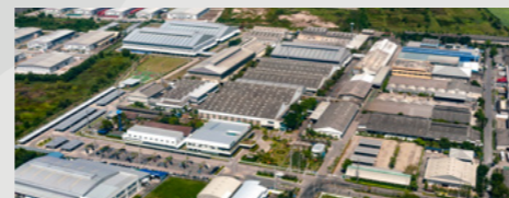
EUROLINK BUSINESS PARK Sittingbourne