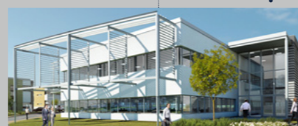
EUREKA BUSINESS PARK Ashford